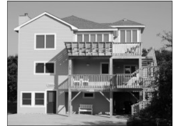
Oceanside - Duck 6 bedrooms, 5 baths Close to Beach & Amenities MLS#66042 $749,000