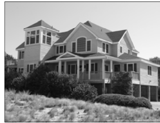
Bed & Breakfast - Duck 6 bedrooms, 6 baths Commercial Zoning MLS#60498 $879,000