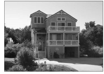
Oceanside - Duck 5 bedrooms, 4.2 baths Beautiful Finishes, Water Views MLS#63676 $989,500

First Class Mail US Postage PAID Kitty Hawk NC Permit No. 70