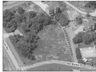
Oceanside—Duck Lot in X Flood Zone Subdivide into 2 lots MLS#65159 $495,000