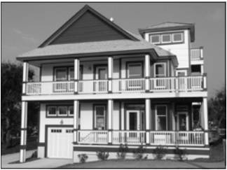
Between Highways - KDH 4 bedrooms, 4.1 baths Custom Built as Model Home MLS#60174 $569,000