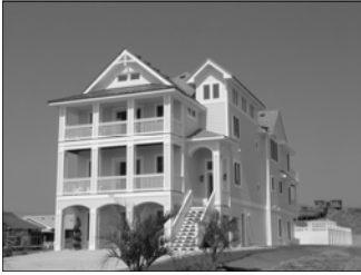
Oceanfront - KDH 10 bedrooms, 10.2 baths Outstanding Rental Income MLS#59773 $2,275,000